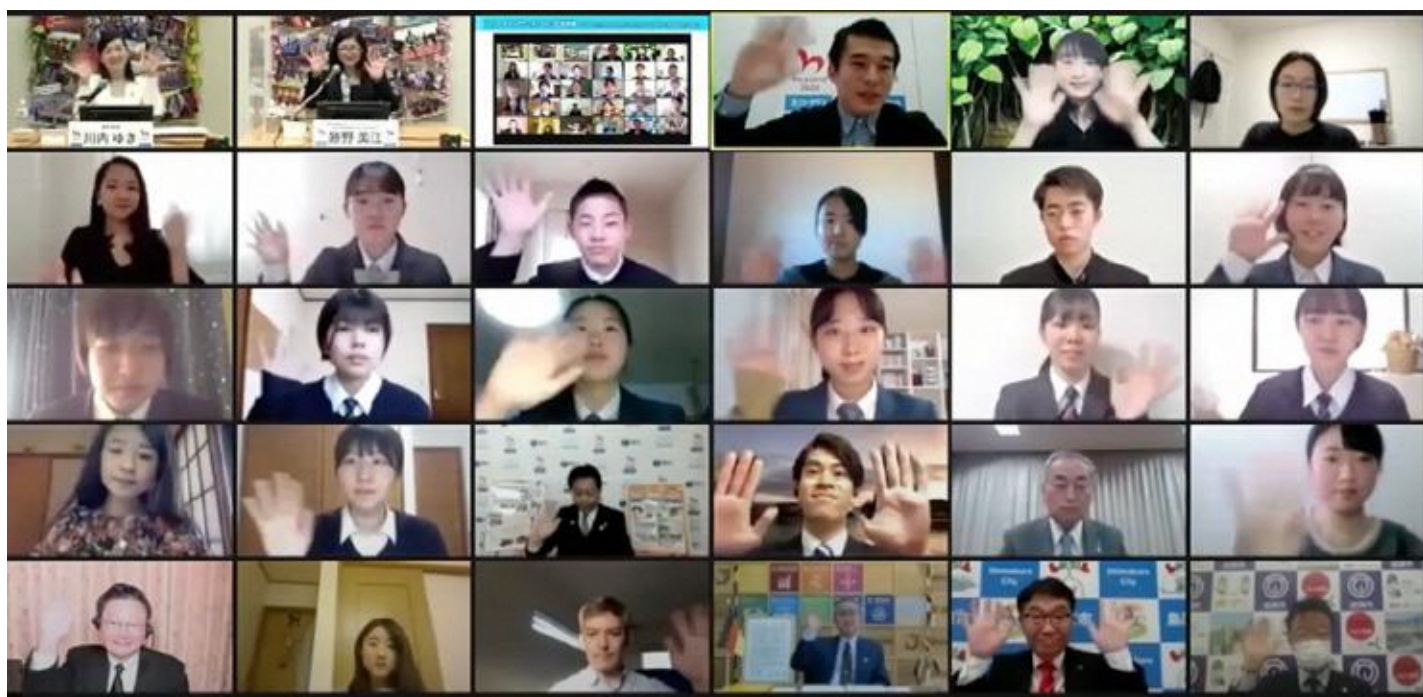
High school students and other participants at the Host Town Summit held online on February 21, 2021