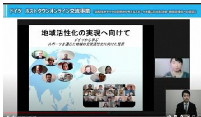
A scene from the presentation by high school students at the online Host Town Summit